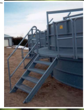
Non-slip stairs/ ladder