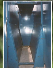
Fauna chute, palpation cage and alley section