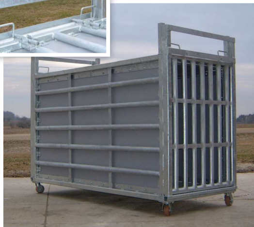
Polar Bear Express, Cochrane Ontario Polar bear transport crate, many sizes available