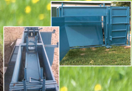
Fauna chute, palpation cage and alley section