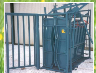
Bison chute with manual headgate