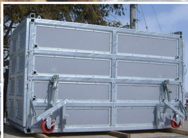
Hippo Transport Crate