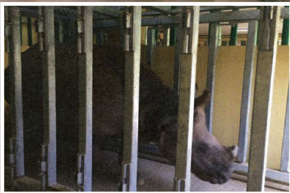
Asha in the TAMER™ October 2013