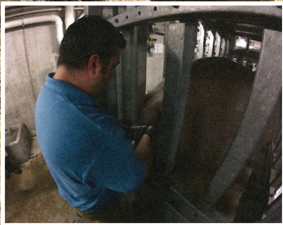
Blood being drawn in the TAMER™

The TAMER™ provides a safe place for blood draws, "We experimented with different tail positions and needle angles, finding success with drawing blood from the side of the tail," says Mark Hacker, Animal Husbandry Staff.