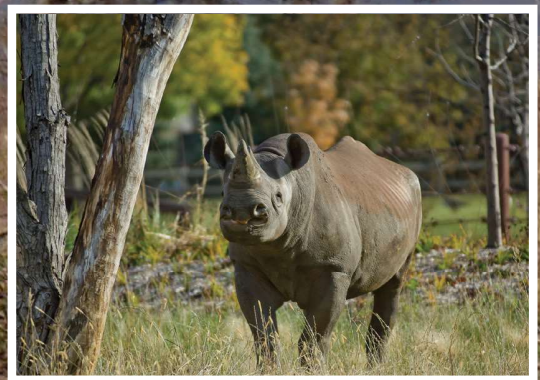
Jubba enjoying his new home at the Rare Rhinos Exhibit