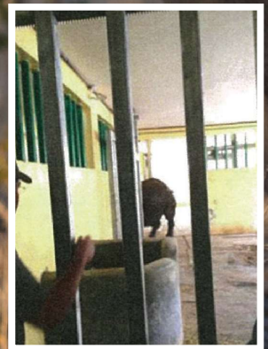
Inside the rhino's air conditioned night house and management area.