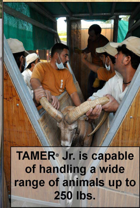
TAMER® Jr. is capable of handling a wide range of animals up to 250 lbs.