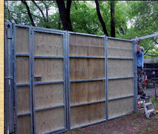
Simple design allows for quick and easy set up in most locations.

NOTES: Jonathan Bergmann DVM, veterinarian for the Turtle Back Zoo and a consulting vet for many game parks and zoos, uses the portable TAMER® system on larger herds for annual exams, hoof trims, vaccinations, sorting individuals as well as loading and unloading animals. For all of these procedures SAFETY and EFFICIENCY are key! The TAMER® system saves time and money by providing a safe work environment and eliminating the need for chemical immobilizations and reducing capture related risks. A complete TAMER® system is easily transported via truck and trailer allowing for the management of animals at various and numerous locations.