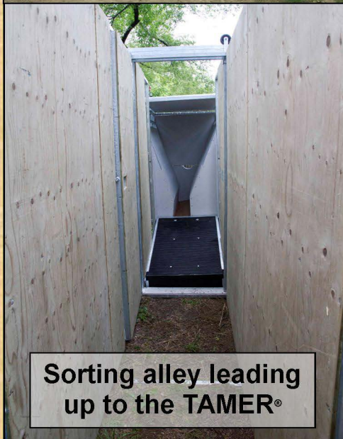
Sorting alley leading up to the TAMER®