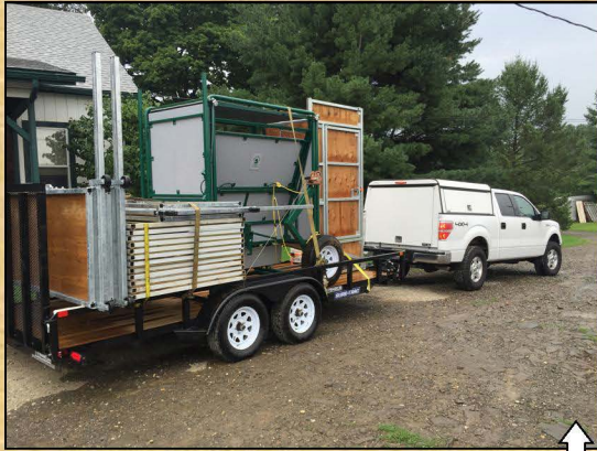
Stackable panels and gates and the TAMER® are easily loaded and transported on a standard trailer.

EQUIPMENT: TAMER Jr.® sorting alley, transport truck and trailer